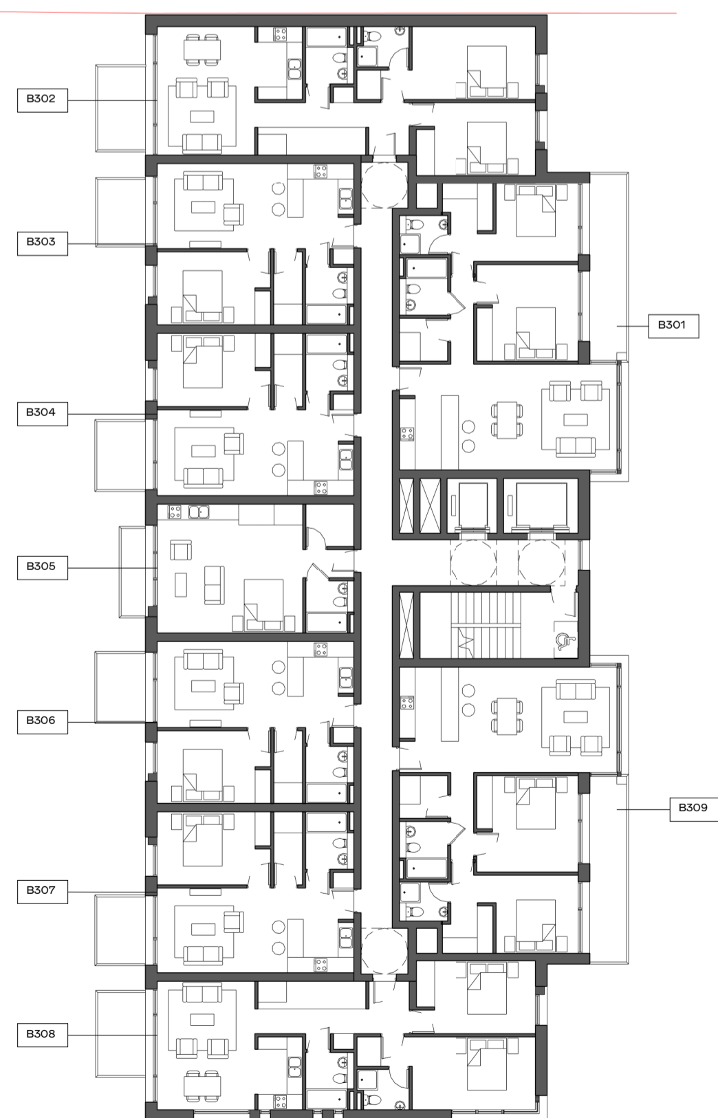
2 Block B Level 3-6 1:200