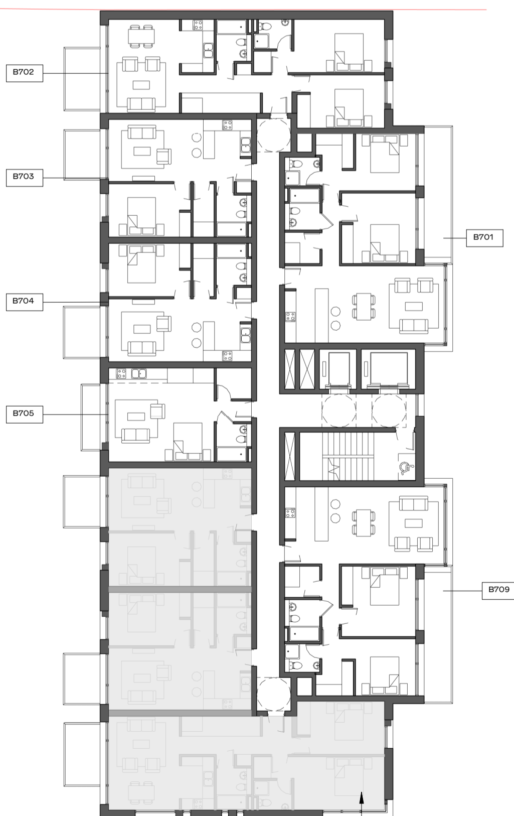
3 Block B level 7 1:200

GREYED OUT APARTMENTS NOT OFFERED AS PART OF PART V